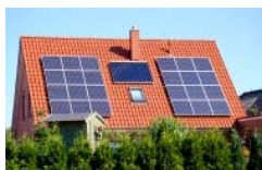
On-grid residential roof-tops