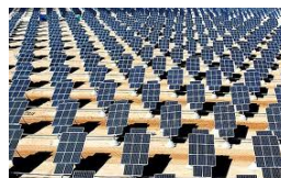
Solar Power plants