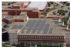
On-grid commercial/ industrial roof-tops