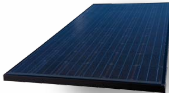
BlackBlack With black backsheet and frame

First class photovoltaic modules from KPV Solar GmbH surpass all the quality standards stipulated in European markets. The highly efficient mono-crystalline solar modules on a 6"-wafer base are manufactured exclusively in Austria using the very latest equipment. Innovative testing ensures exact technical performance data for each individual module. The solar modules with a power of 245 - 250 Wp are delivered with aluminium frames and glass fibre reinforced edge connectors. As standard a Tyco junction box is used. Only top-quality solar modules leave the KIOTO Photovoltaics GmbH production line. These output and profit optimized solar modules are designed mainly for the use in on grid systems.