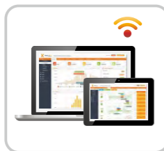
Internal WIFI & Remote Monitoring