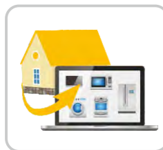
Load Remote Control